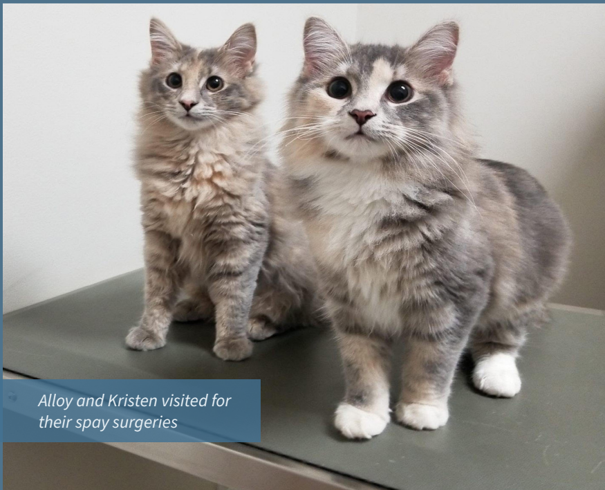
Alloy and Kristen visited for their spay surgeries

Many thanks to all who made 2019 a successful and lifesaving year!